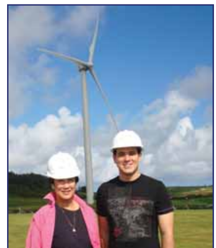
Inspecting Wind Farms as Part of State's Renewable Energy Strategy