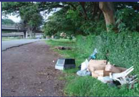
Access Road Behind Moanalua Middle School is State DOT Property; Any Dumping @ This Site Can Be Reported to DOT Hotline: 831-6714