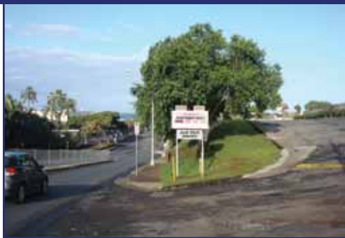
Kam Swap Meet Switching Current Entrance & Exit Mid-July.