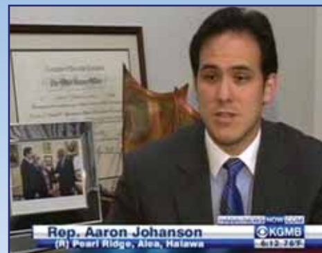
News Coverage of Silver Alert Bill

HB 1615 – Establishes an Advisory Commission to examine State agencies & regulations to improve function & performance. ( SENATE VERSION HEARD )