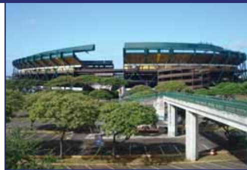
Reroofing, New Field & Hand Rail Installation Completed by Sept. 3rd, UH's Season Opener vs. Colorado