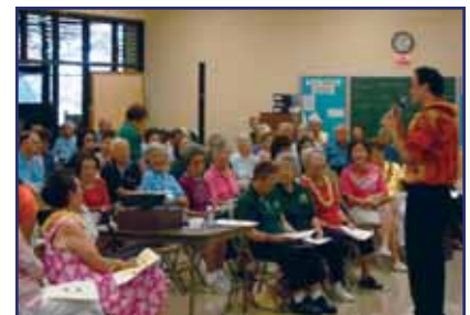
Briefing 130 Moanalua Seniors on Legislation Impacting the Elderly