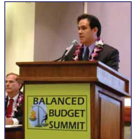
Speaking on Creating & Maintaining a Vibrant Economy