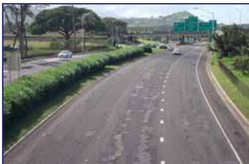
Moanalua Freeway Resurfacing to be Completed by Early 2012