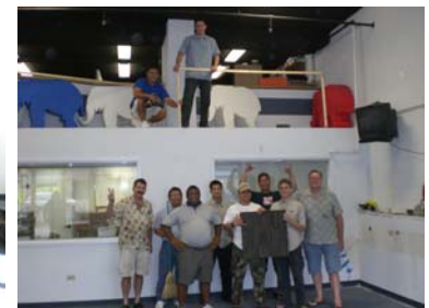
With the hard work of D&D Furniture, American Carpet One and some energetic volunteers from the Party, the renovation was finished ahead of schedule and headquarter business went uninterrupted.